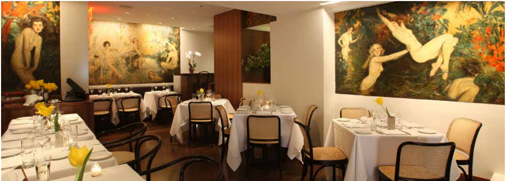
The Leopard / Mezzanine level surrounded by 1920s landmark murals by Howard Chadler Christy