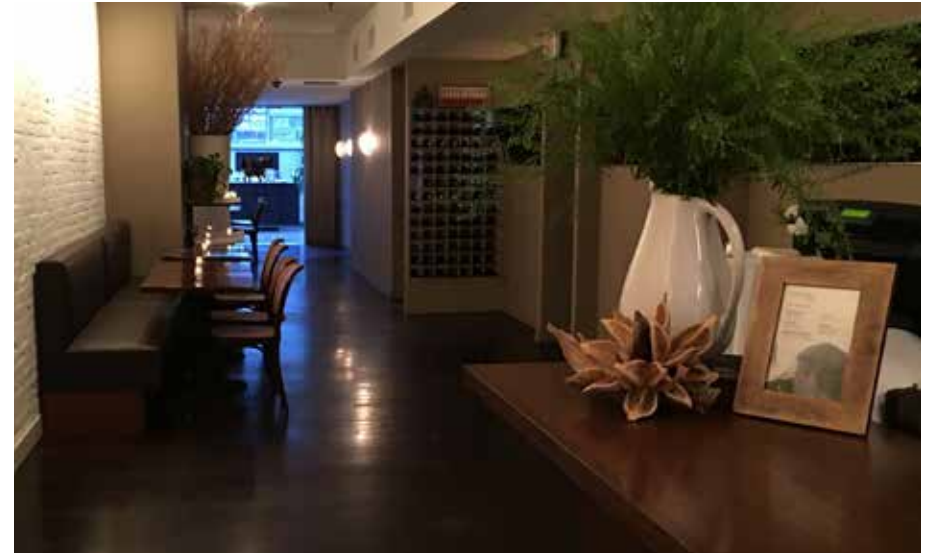
Mozzarella & Vino / Main Dining Room / available for partial or full buyout