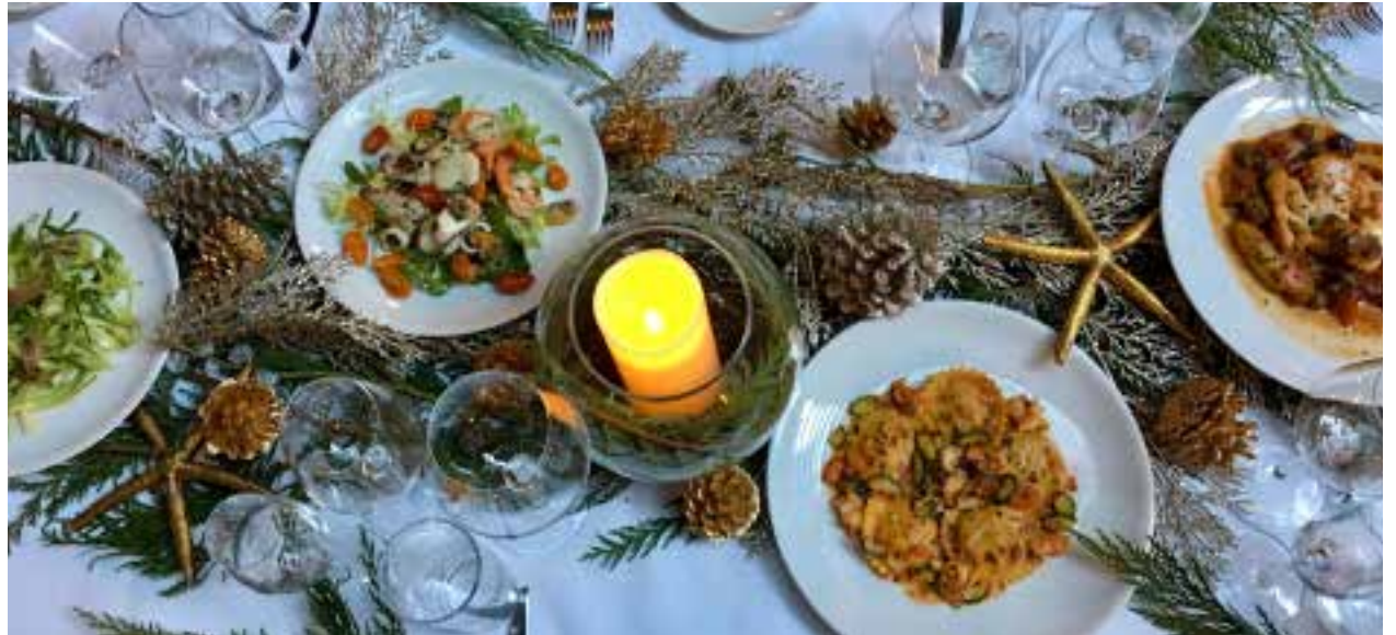
Il Gattopardo / Atruim / dressed for the Holidays