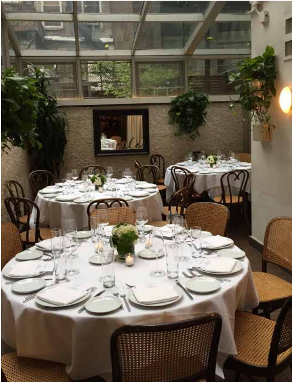
Mozzarella & Vino / Garden / seats up to 24 guests on round tables