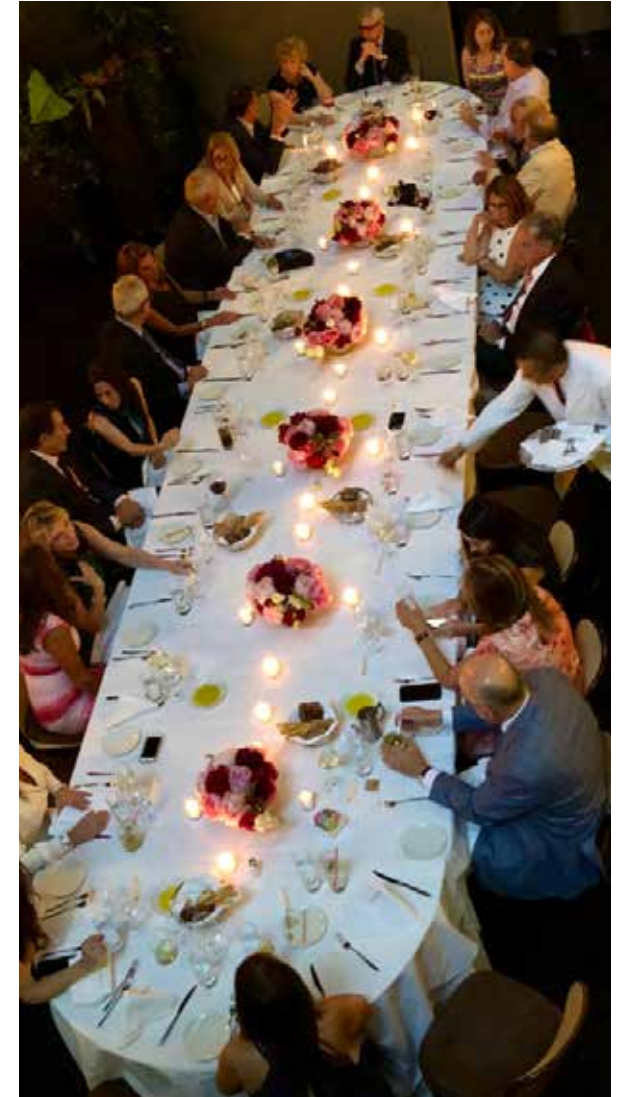
Il Gattopardo / Atrium / oval table, seats up to 30 guests