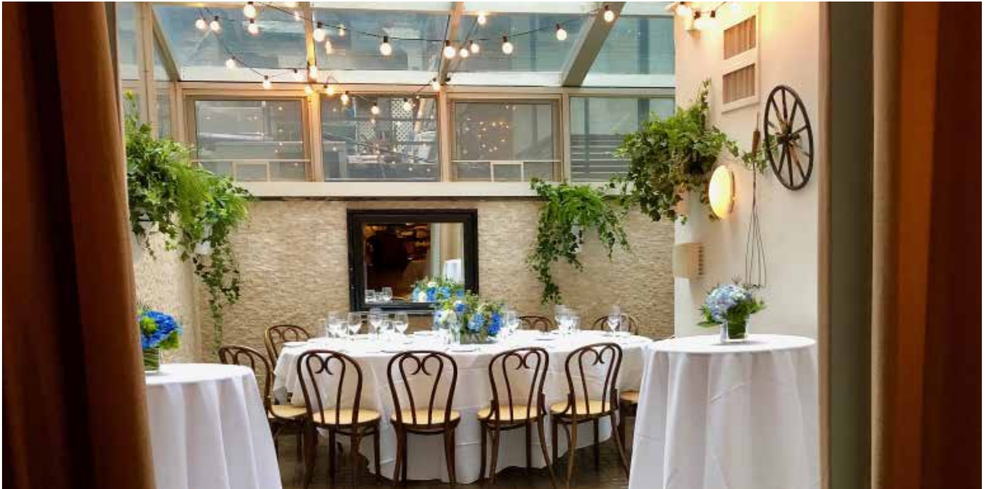
Mozzarella & Vino / Garden / seats up to 24 guests

In either sunlight or candlelight, bring the warm ambiance of a rustic Italian countryside to your next event!