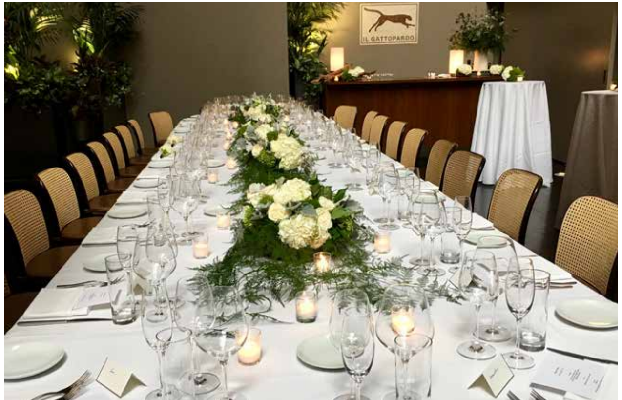
Il Gattopardo / Atrium / Oval table, seats up to 30 guests, with bar and cocktail high

Round, oval, long, hollow square, high tops. Our planters and bar are on casters and can be moved (yes, just like a theater!) to create the perfect space. Lets party!