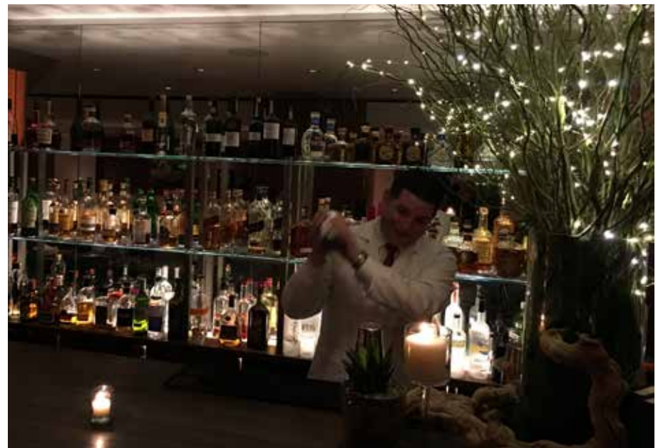
The Leopard / Bar