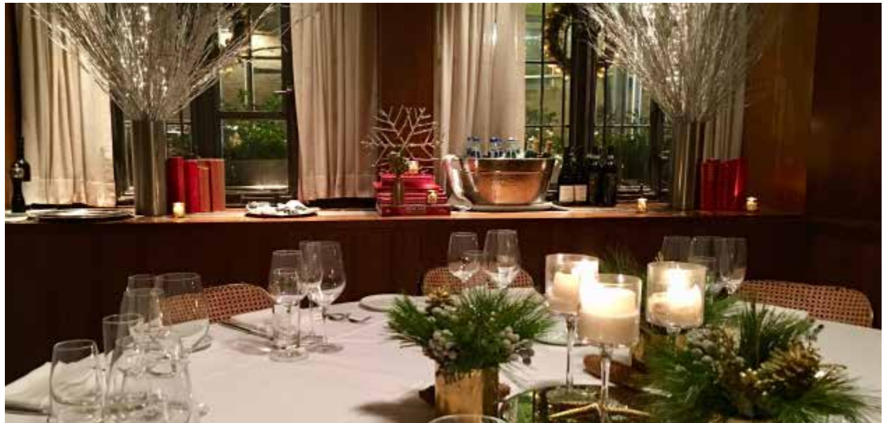
The Leopard / Parlor / dressed for the Holidays