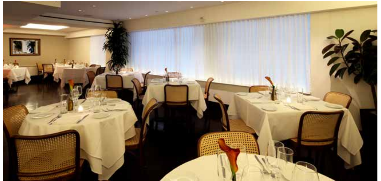
Il Gattopardo / Main Dining Room / available for full buyout