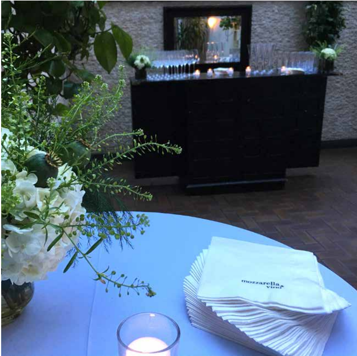
Mozzarella & Vino / Garden / cocktail reception for up to 40 guests