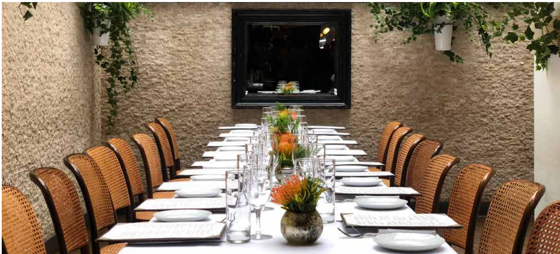
Mozzarella & Vino / Garden / seats up to 18 guests on a long table