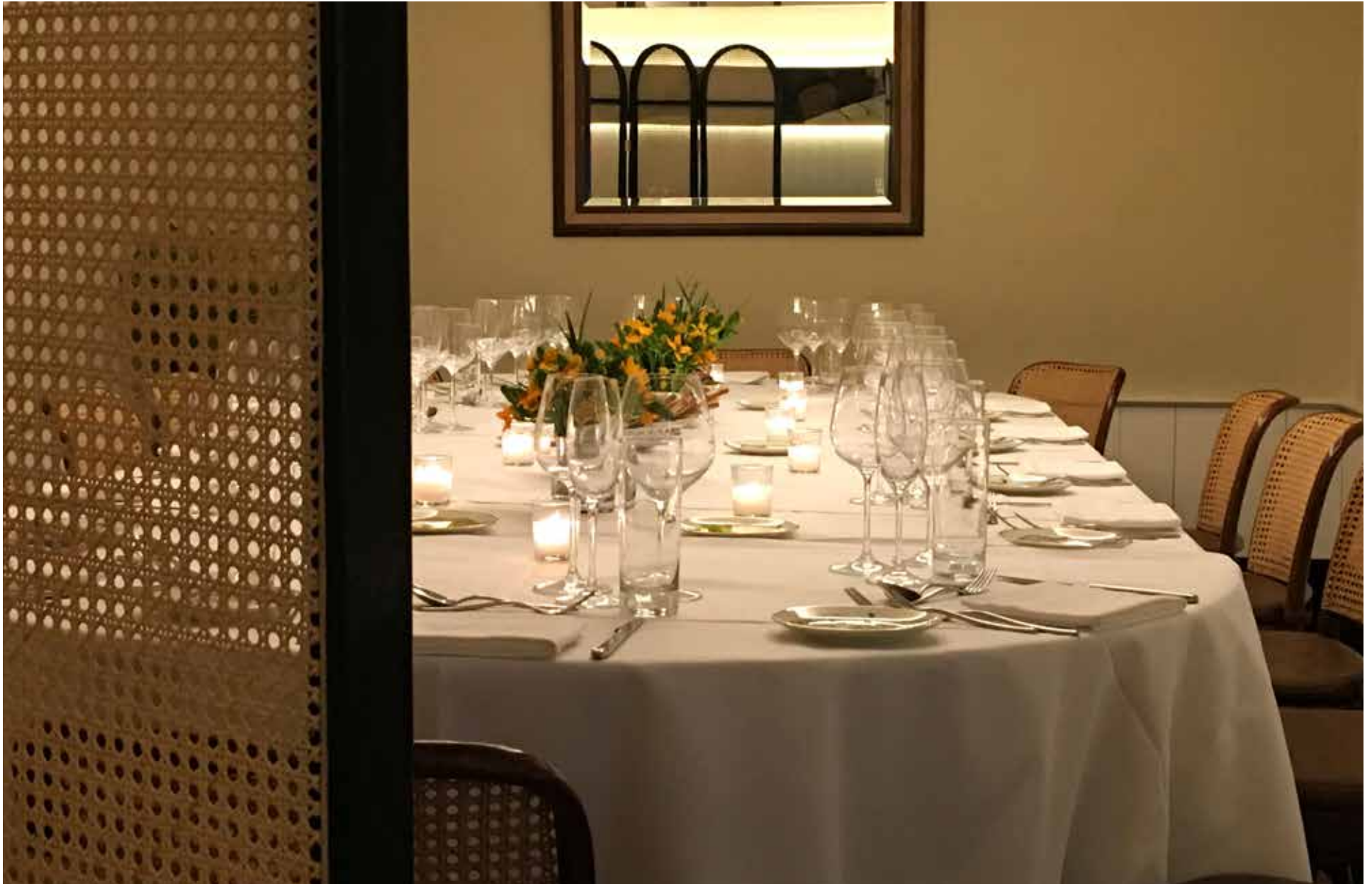
Il Gattopardo / Alcove / semi-private intimate space located in the main dining room, seats up to 16 guests