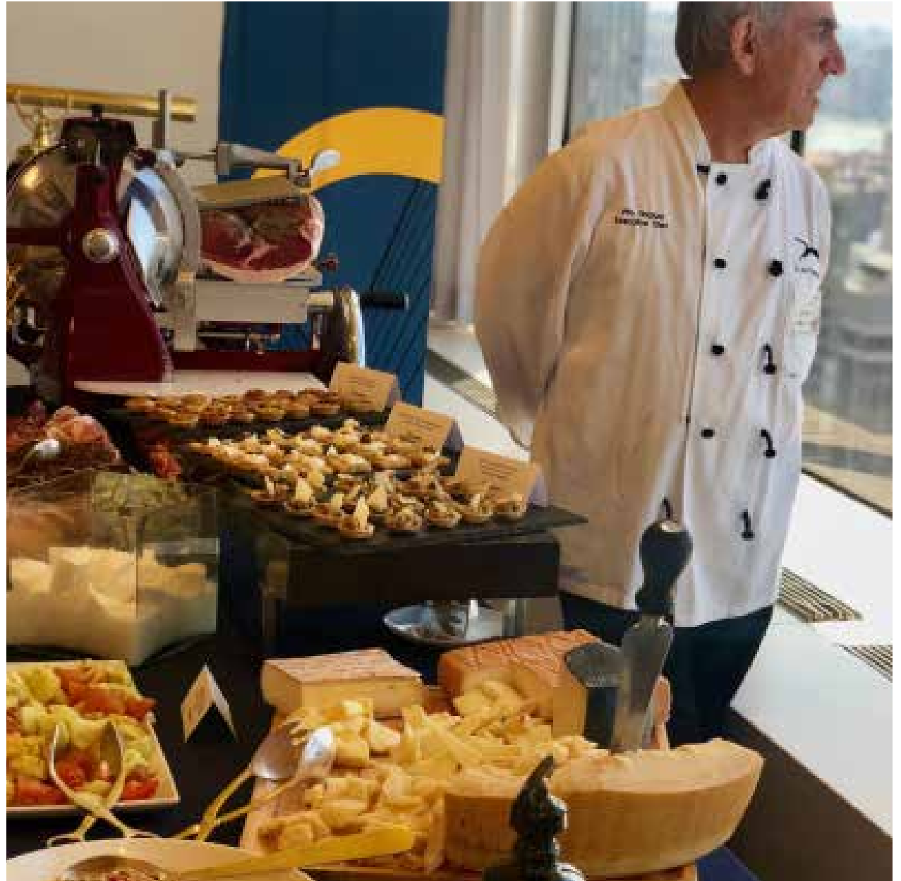
Affettati and antipasti station