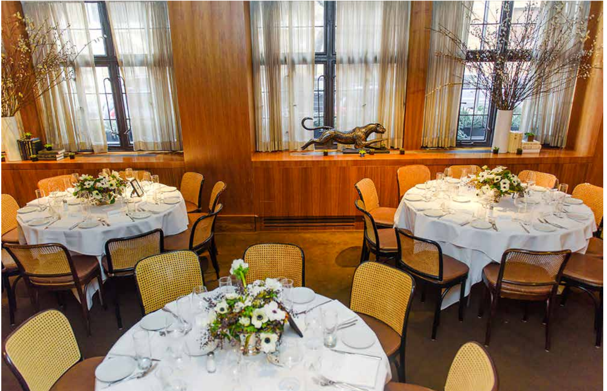
The Leopard / Main Dining Room / available for full buyout, seats up to 90 guests