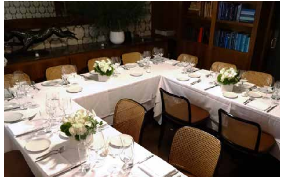
The Leopard / The Parlor, Private Room / seats up to 18 guests on open square table