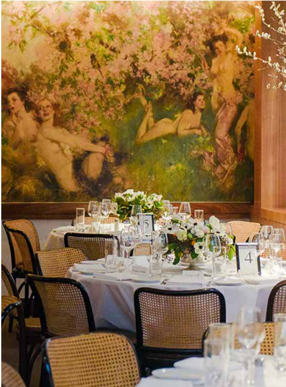
The Leopard / Main Dining Room / original 1920s murals by Howard Chandler Christy