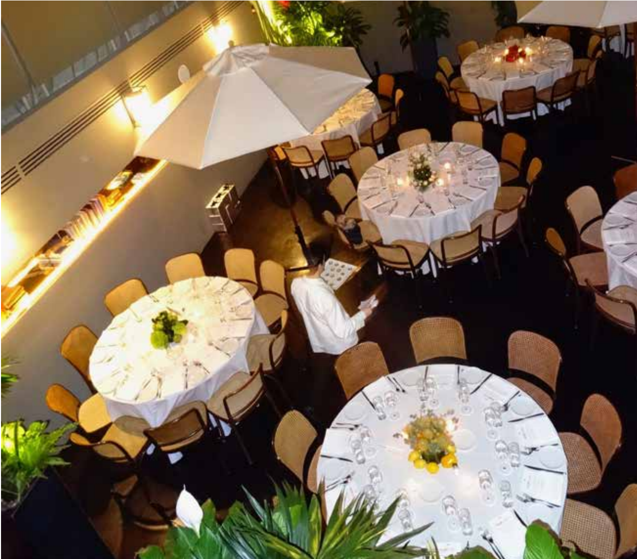
Il Gattopardo / Atrium / seats up to 70 guests

IL GATTOPARDO stunning, lushly planted Atrium has a soaring skylight, and seats up to 70 guests. The adjacent Cellar , with its moveable bar, is available for standing cocktails or can be reserved separately for meetings and seated dinners for up to 30 guests. Together , the two rooms seat up to 120 guests.