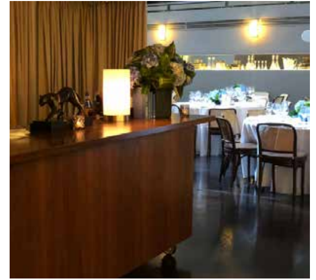
Il Gattopardo / Cellar