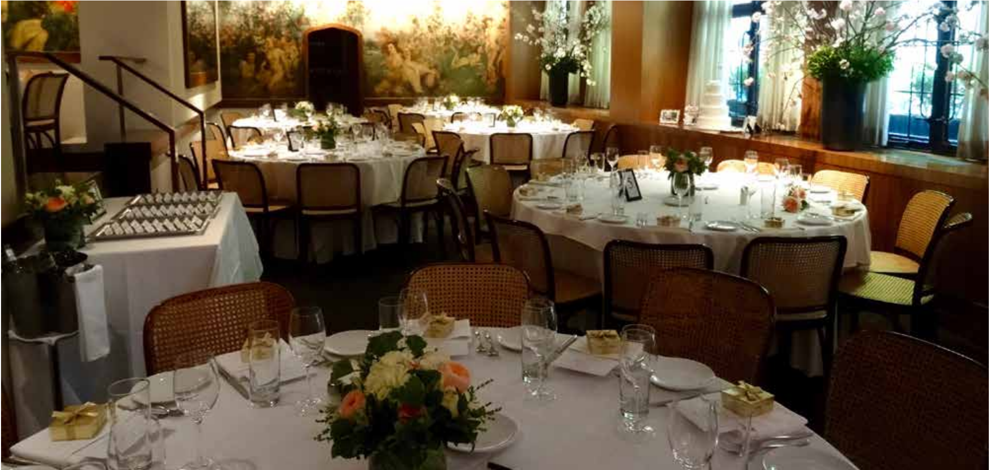
The Leopard / Main Dining Room / available for full buyout, seats up to 90 guests or 130 guests for cocktail reception

For intimate dinners, we also offer The Parlor , an exquisite private room adjacent to the building's stately lobby, which seats up to 18 guests.