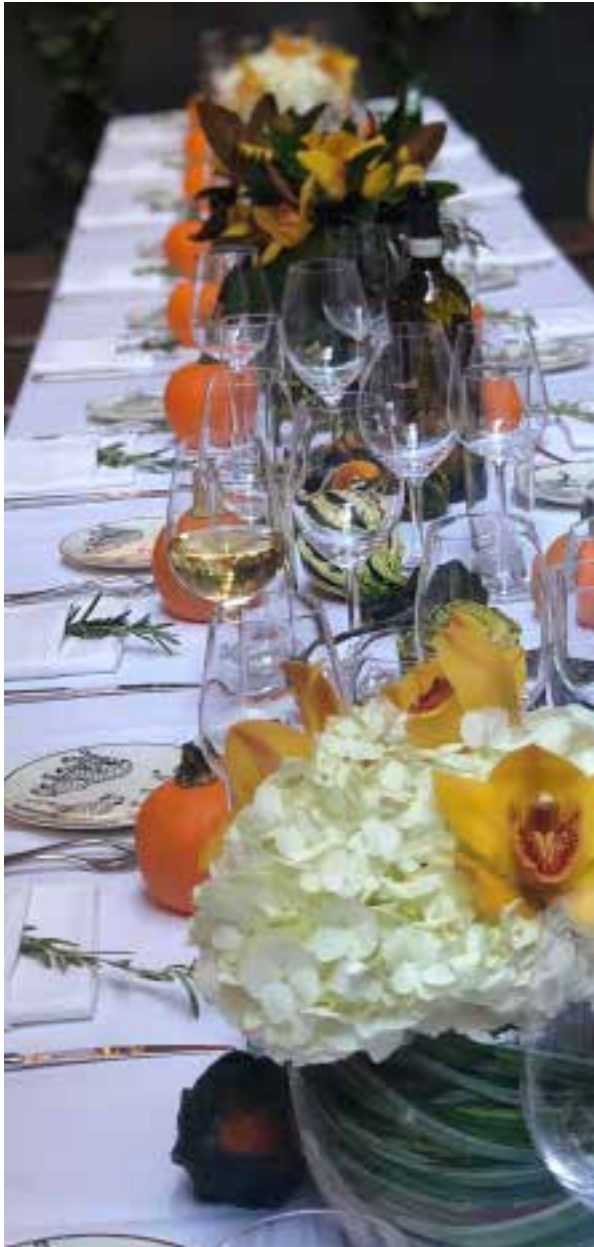
Il Gattopardo / Atruim / dressed for the Holidays