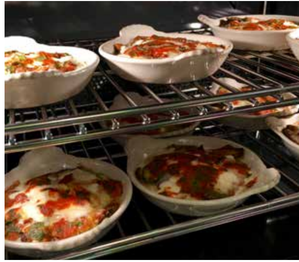
Parmigiana of zucchini with smoked mozzarella