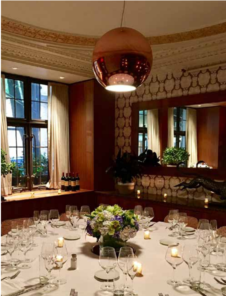
The Leopard / The Parlor, Private Room / seats up to 16 guests on round table