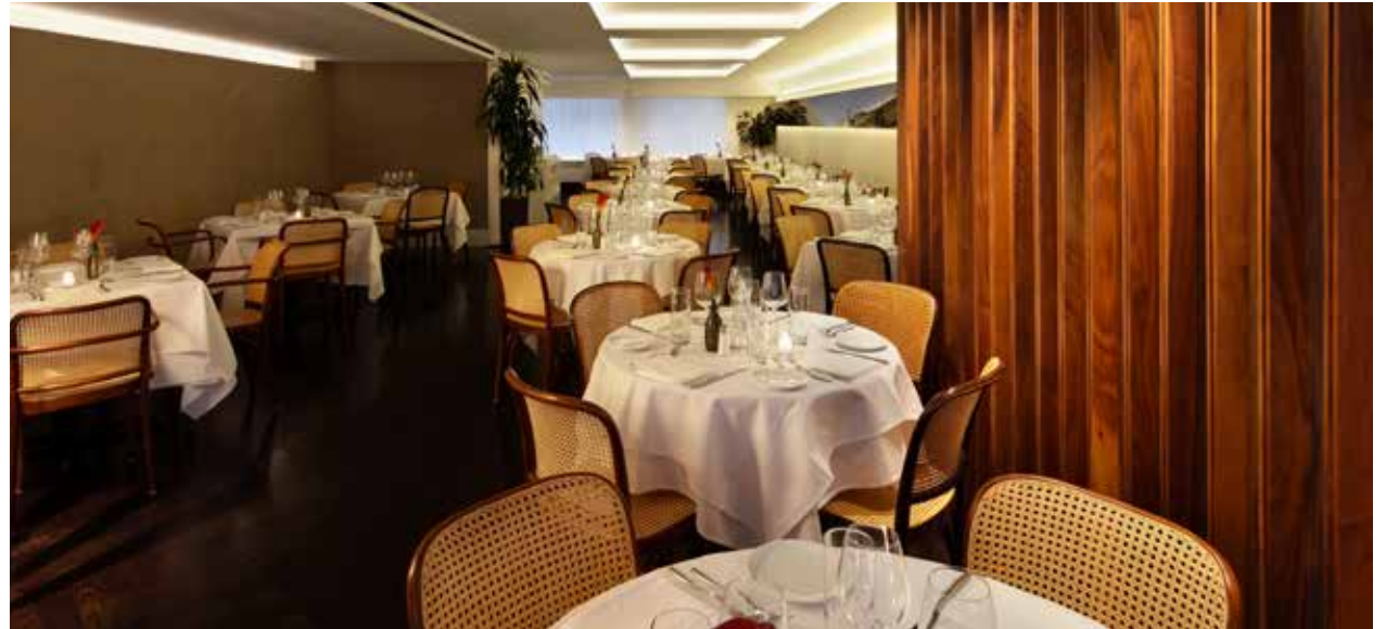
Il Gattopardo / Main Dining Room / available for full buyout