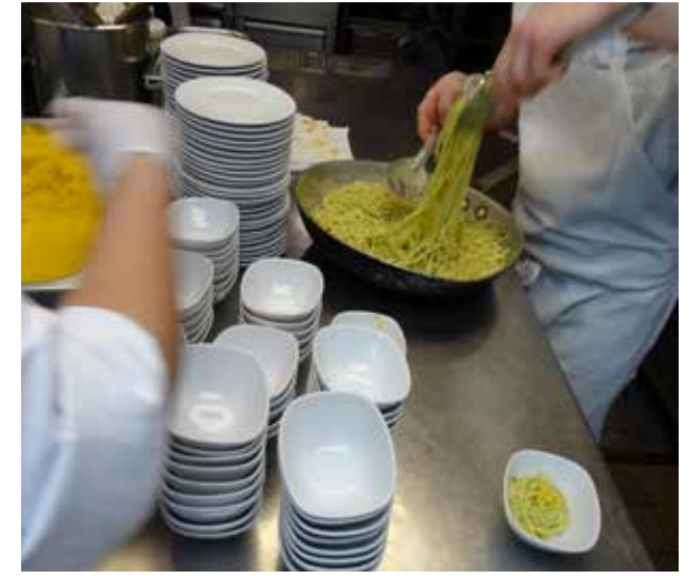
Spaghetti with grey mullet bottarga