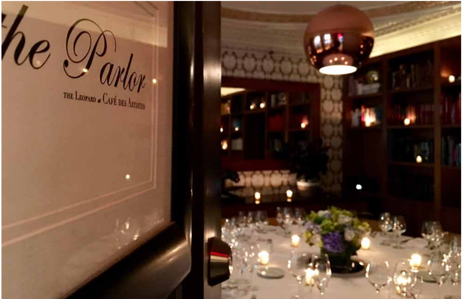
The Leopard / The Parlor, Private Room / seats up to 18 guests