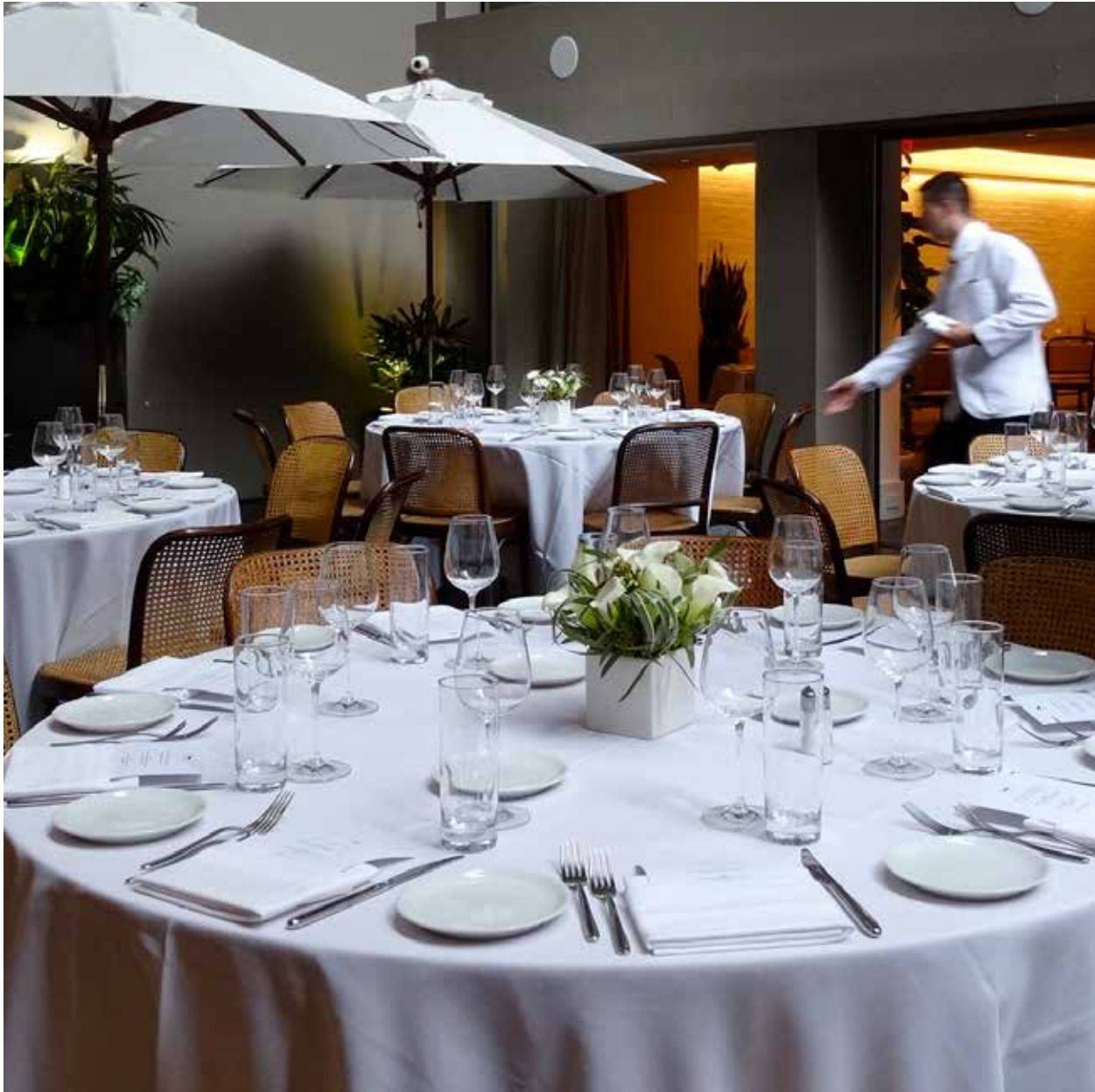
Il Gattopardo / Atrium