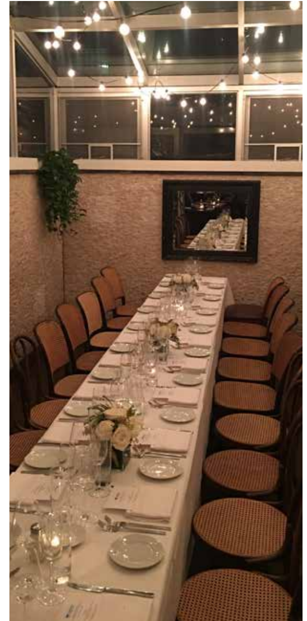
Mozzarella & Vino / Garden / charming long table