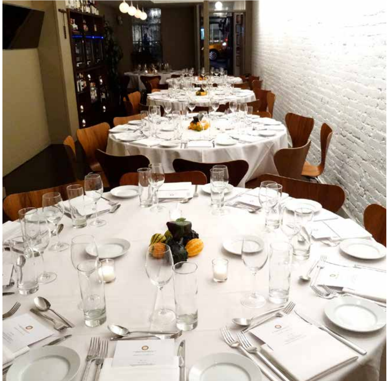
Mozzarella & Vino / Main Dining Room / available for partial or full buyout, seats up to 70 guests