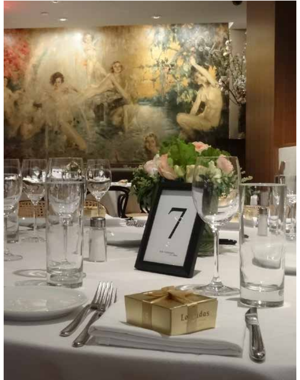
The Leopard / Main Dining Room / seats up to 90 guests