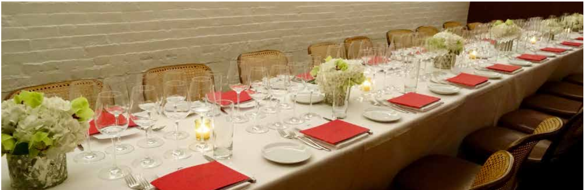
Il Gattopardo / Cellar